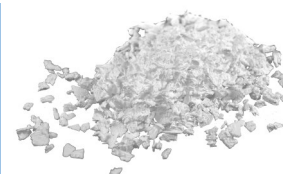
EMADrone magnesium perchlorate B1161