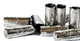
Nickel capsules pressed D3500