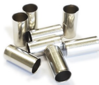
Smooth wall nickel capsule D3510