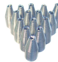
Nickel basket D9153