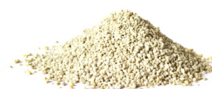
EMASorb B II B1317