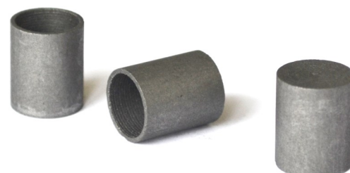
Inner graphite crucible C4611, C4609, C4614