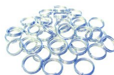
B2503 Ring Standard 1g

A complete range of reference materials can be viewed or downloaded from our website including steel rings, pins, chip and powder, iron chip and powder, titanium, copper and zirconium pins.