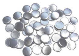
Tin flux pellets D9150