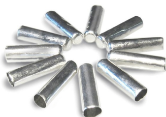
Smooth wall tin capsules D4003