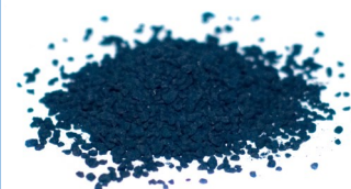
Rare earth copper oxide B1123