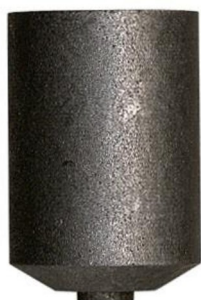
Outer graphite crucible C4610, C4615