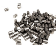
B2610 Pin Standard 0.25g

The use of ELTRA® part numbers is intended for convenience only, and does not imply the products are of OEM origin. All Elemental Microanalysis Ltd products are guaranteed to be of high quality and are deemed to be suitable alternatives in the stated instruments. All ELTRA® trademarks acknowledged.