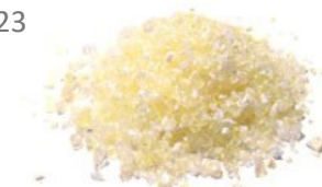
Schutze reagent B1519

These products offer the same high quality and value for money that is typical of Elemental Microanalysis' entire product range. Available to order from our ISO 9001 factory online, by email, telephone or fax. Elemental Microanalysis offers extensive knowledge of analysis, over 40 years of experience and a worldwide reputation