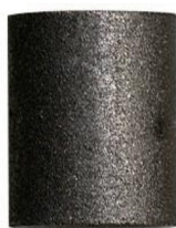
Inner graphite crucible C4611, C4609, C4614