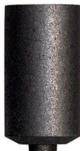
Graphite crucible C4612, C4637, C4638